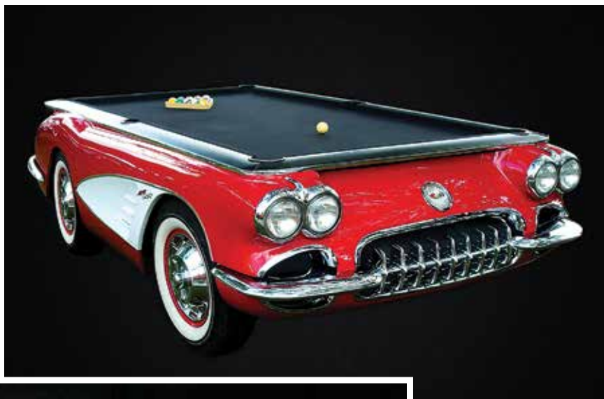
Classics like the '66 Corvette (above) and '69 Shelby (left) are big hits.

His latest challenge came from San Francisco's Fringe Design. Incorporating more visible metal components than his traditional tables, Hatch had to design a table that minimized material below the table bed. The four legs he created attach directly to the top via steel plates that connected the legs to the aluminum frame inside the apron.